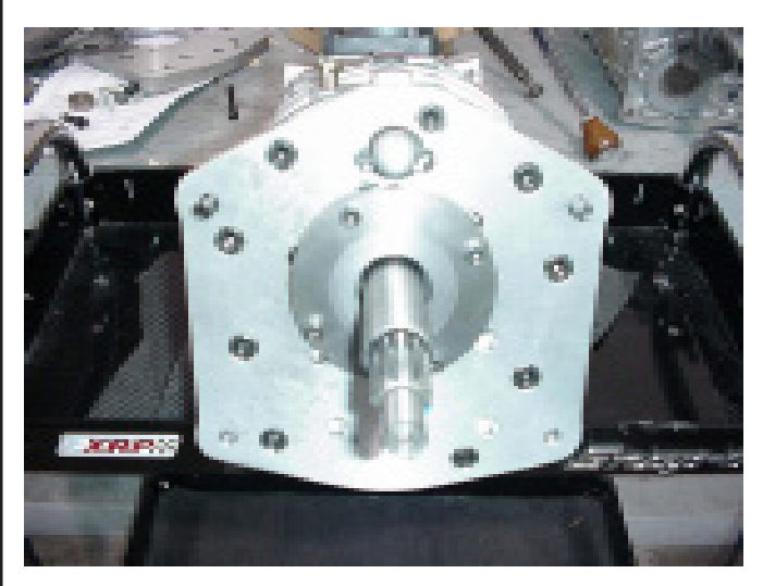
Adapter plate installed on the NV3550