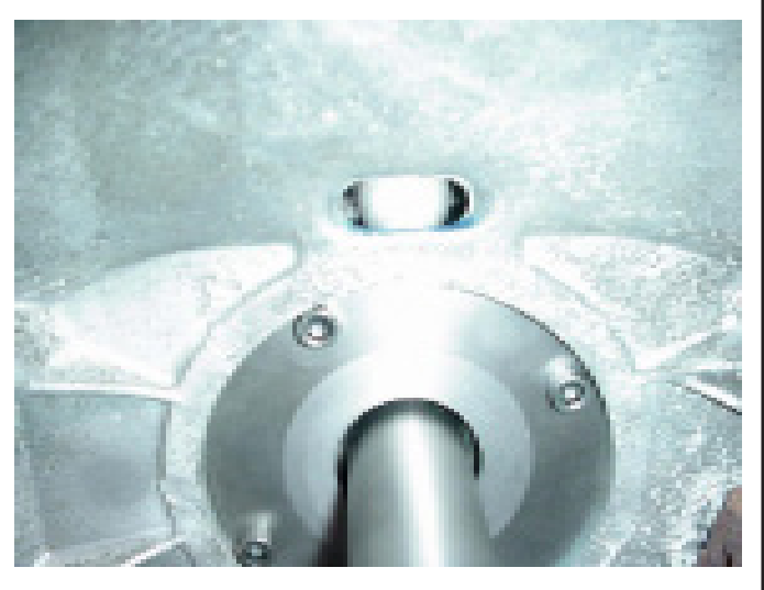
Bellhousing must be modified to clear the NV3550 shift rod.