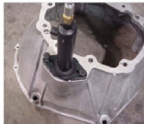
NEW SLAVE CYLINDER INSTALLED