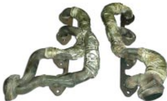
Stock Ford Explorer V8 manifolds for most smog controlled vehicles.