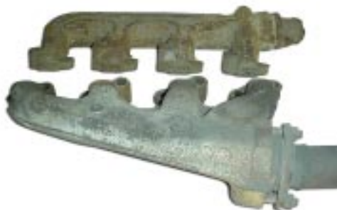
Side view of the early Ford manifolds.