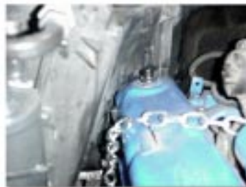
Passenger side valve cover

On both body styles of the Rangers, we recommend doing a "dry run" on the engine installation. The mounts should be installed loosely into the Ranger engine cradle. Lower the block into position on top of the new mounts and adjust the block to the furthest forward location allowed by the slots in the mounts. Adjust the block so that it sets level from side to side. This first trial run will allow you to mark the air box on the passenger side of the vehicle for proper clearance. The driver's side firewall will also require a slight amount of clearance (a small dent in the fire wall to obtain valve cover and head clearance). Remove the engine and perform the necessary modifications to air box and the firewall.