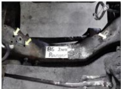
Rangers 1992 & earlier require one hole to be drilled on the driver's side for the mount to be installed.