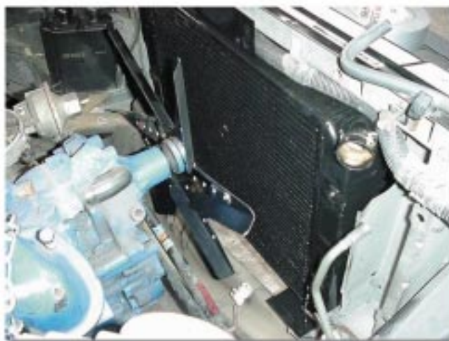
The photo above and photo left show the radiator and fan clearance.