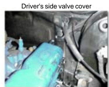
Driver's side valve cover

SPECIAL NOTE: The components packaged in this kit have been assembled and machined for specific type of conversions. Modifications to any of the components will void any possible warranty or return privileges. If you do not fully understand modifications or changes that will be required to complete your conversion, we strongly recommend that you contact our sales department for more information. This instruction sheet is only to be used for the assembly of Advance Adapter components. We recommend that a service manual pertaining to your vehicle be obtained for specific torque values, wiring diagrams and other related equipment. These manuals are normally available at automotive dealerships and parts stores.