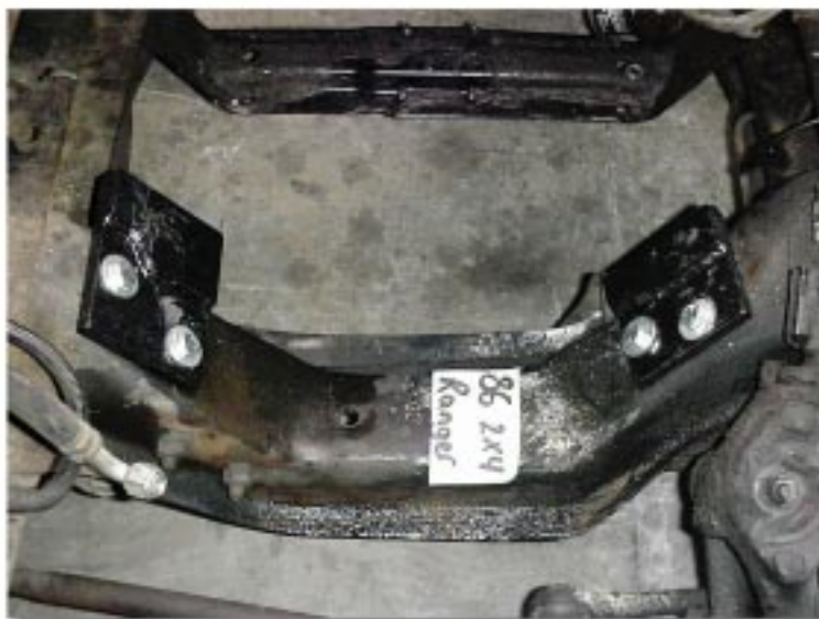
Mounts installed in a Ranger engine cradle

SPECIAL NOTE: The components packaged in this kit have been assembled and machined for specific type of conversions. Modifications to any of the components will void any possible warranty or return privileges. If you do not fully understand modifications or changes that will be required to complete your conversion, we strongly recommend that you contact our sales department for more information. This instruction sheet is only to be used for the assembly of Advance Adapter components. We recommend that a service manual pertaining to your vehicle be obtained for specific torque values, wiring diagrams and other related equipment. These manuals are normally available at automotive dealerships and parts stores.