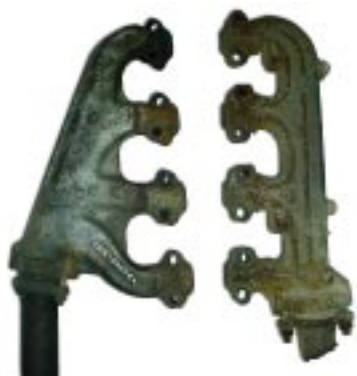
Early stock Ford manifolds that fit with our motor mounts.

After the exhaust system is bolted to the block and you've check for clearances on the block and exhaust, secure the motor mounts to the cradle.