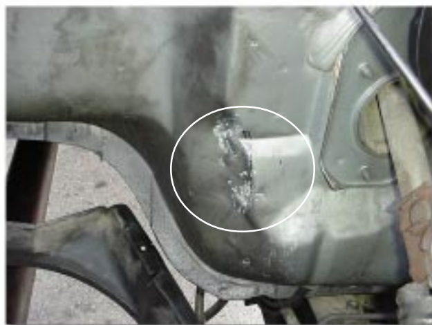
The photo above shows the driver's side firewall modifications.