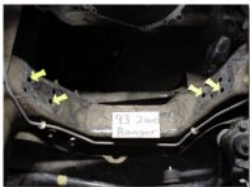
The stock holes on 1993 and newer vehicles are used to mount our mounts.