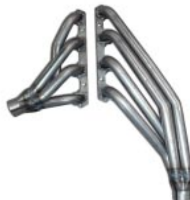
Advance Adapters conversion headers for the 2WD Ford Ranger

SPECIAL NOTE: The components packaged in this kit have been assembled and machined for specific type of conversions. Modifications to any of the components will void any possible warranty or return privileges. If you do not fully understand modifications or changes that will be required to complete your conversion, we strongly recommend that you contact our sales department for more information. This instruction sheet is only to be used for the assembly of Advance Adapter components. We recommend that a service manual pertaining to your vehicle be obtained for specific torque values, wiring diagrams and other related equipment. These manuals are normally available at automotive dealerships and parts stores.