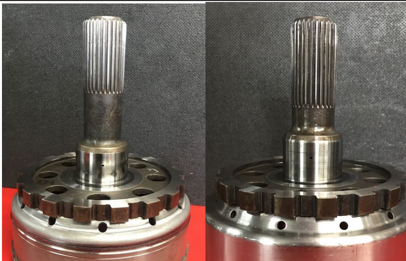
This shaft will require the 3/4" spacer. shaft final stickout would be 4.5"