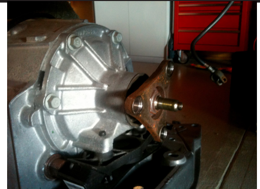
Fixed yoke 6L80 transmission that can be used but the shaft must be cut.

Note: 6L90 4WD transmission output shafts. We have seen two different lengths of outputs. One is similar to the 6L80 4WD and the other is longer. The longer shaft is approximately 5" +/- stickout. Trimming this shaft will not allow enough splines to fit the transfer case. A 3/4" spacer will be needed and you will still need to modify the shaft length. long shaft is GM 24264191 or GM 24285487