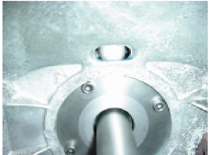
Bellhousing must be modified to clear the NV3550 shift rod.