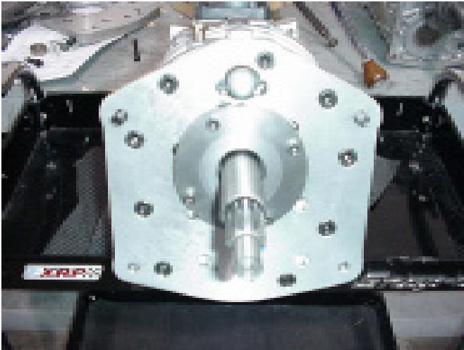
Adapter plate installed on the NV3550