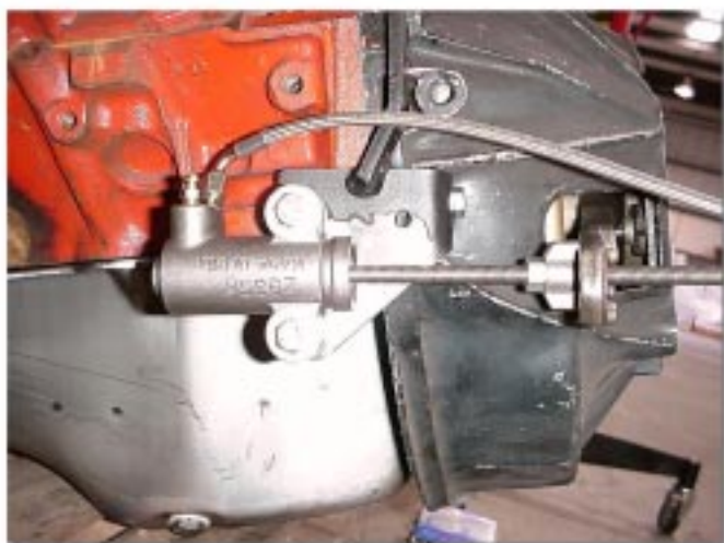
P/N 716116 Installed