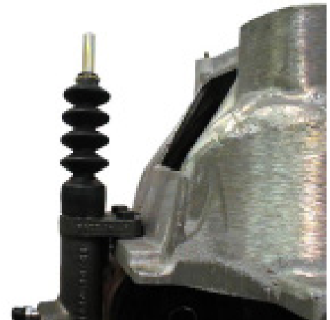
The rear gusset was removed to allow this slave cylinder to mount to the bellhousing.