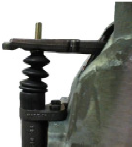
GM arm installation