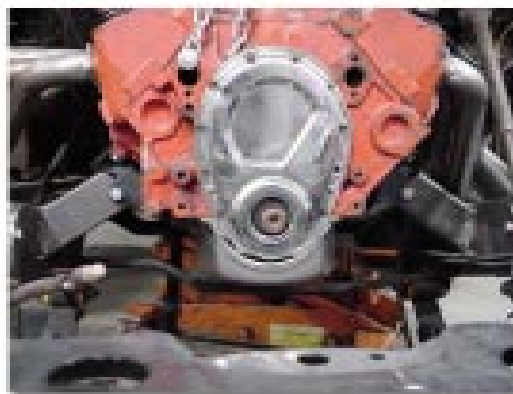
Motor offset to the driver's side

SPECIAL NOTE: The components packaged in this kit have been assembled and machined for specific type of conversions. Modifications to any of the components will void any possible warranty or return privileges. If you do not fully understand modifications or changes that will be required to complete your conversion, we strongly recommend that you contact our sales department for more information. This instruction sheet is only to be used for the assembly of Advance Adapter components. We recommend that a service manual pertaining to your vehicle be obtained for specific torque values, wiring diagrams and other related equipment. These manuals are normally available at automotive dealerships and parts stores.