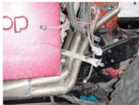
717038 Headers (passenger side)