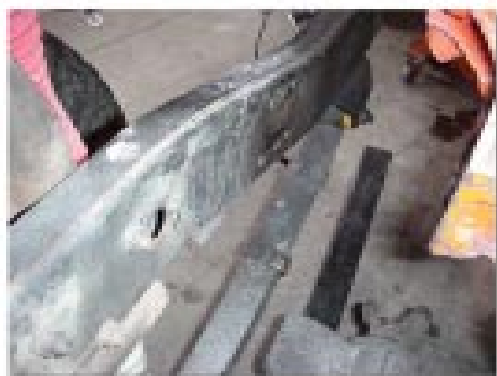
2. Frame rail ground flat.