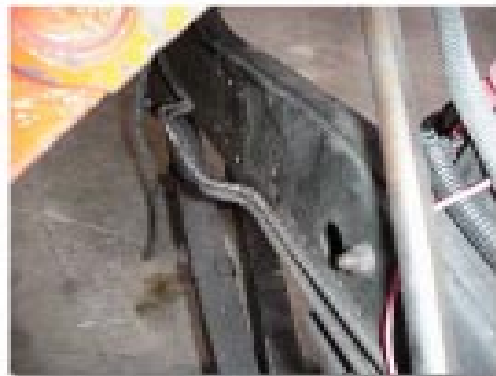
3. Driverside frame with stock mount removed.