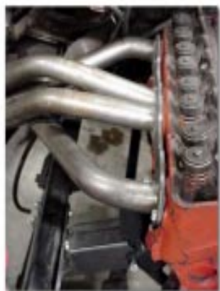
Steering clearances on 717038 headers