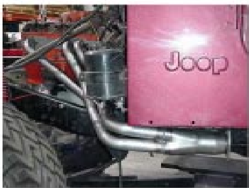
717038 Headers (driver's side)