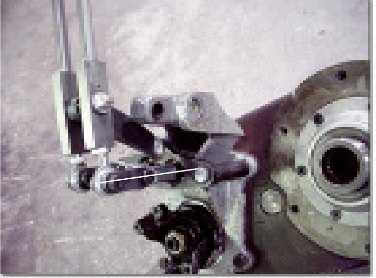
Notice parallel alignment of female heim joint and link plate.

<u>SPECIAL NOTE:</u> The components packaged in this kit have been assembled and machined for specific type of conversions. Modifications to any of the components will void any possible warranty or return privileges. If you do not fully understand modifications or changes that will be required to complete your conversion, we strongly recommend that you contact our sales department for more information. This instruction sheet is only to be used for the assembly of Advance Adapter components. We recommend that a service manual pertaining to your vehicle be obtained for specific torque values, wiring diagrams and other related equipment. These manuals are normally available at automotive dealerships and parts stores.